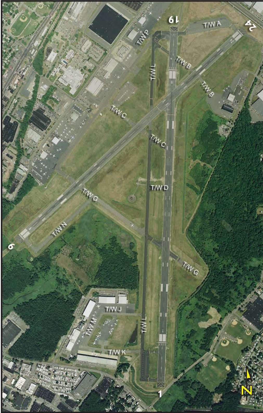
Teterboro Airport (TEB) Teterboro, NJ