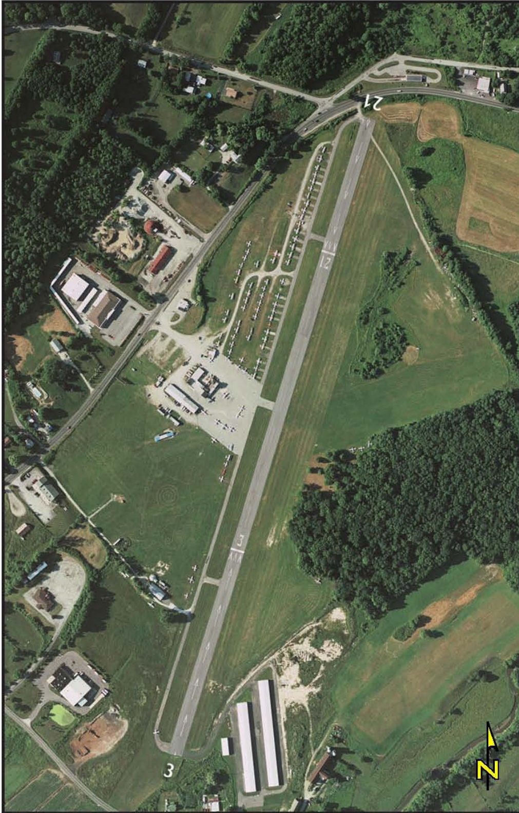
Sussex Airport (FWN) Sussex, NJ