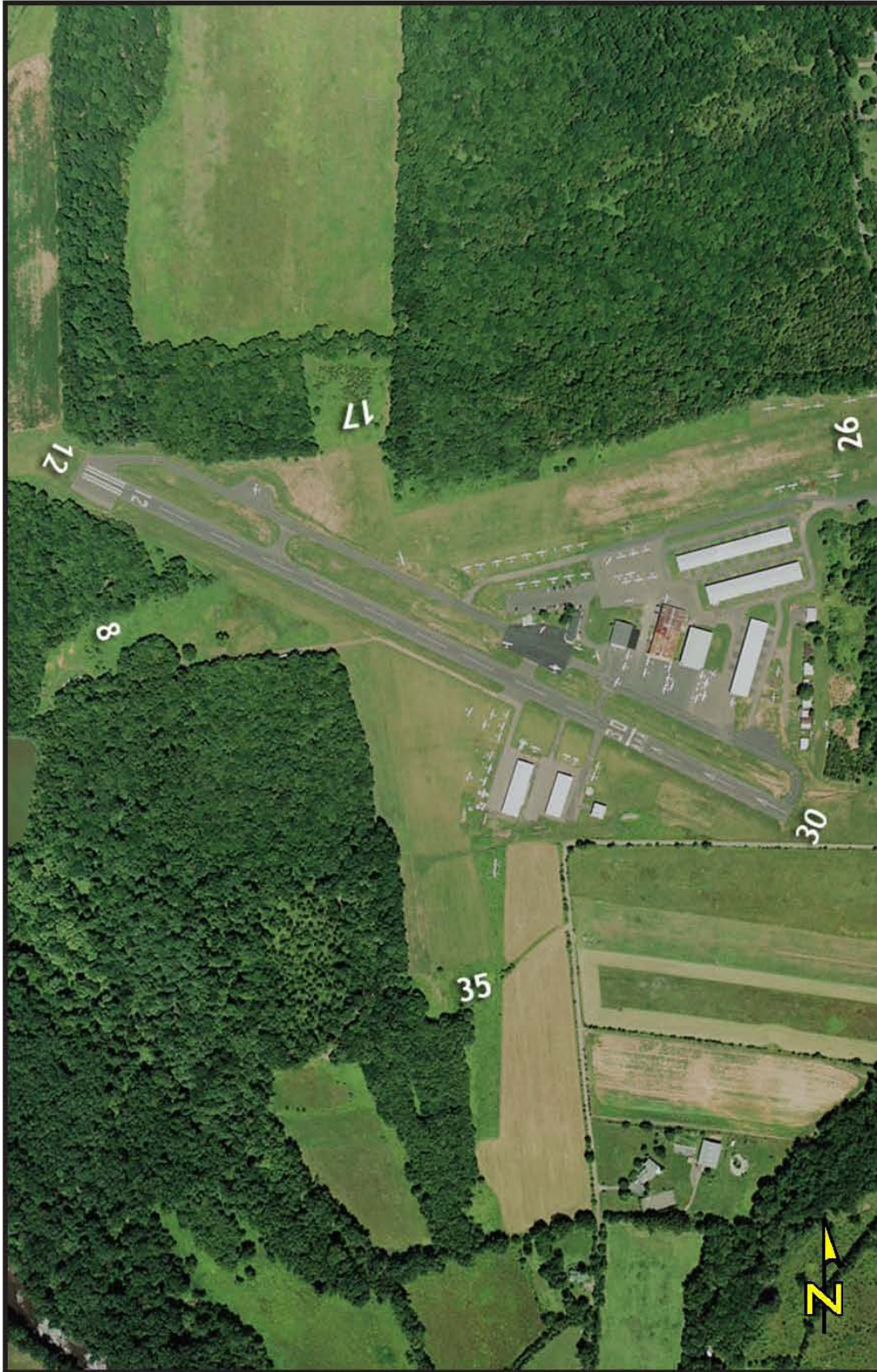
Somerset Airport (SMQ) Somerville, NJ