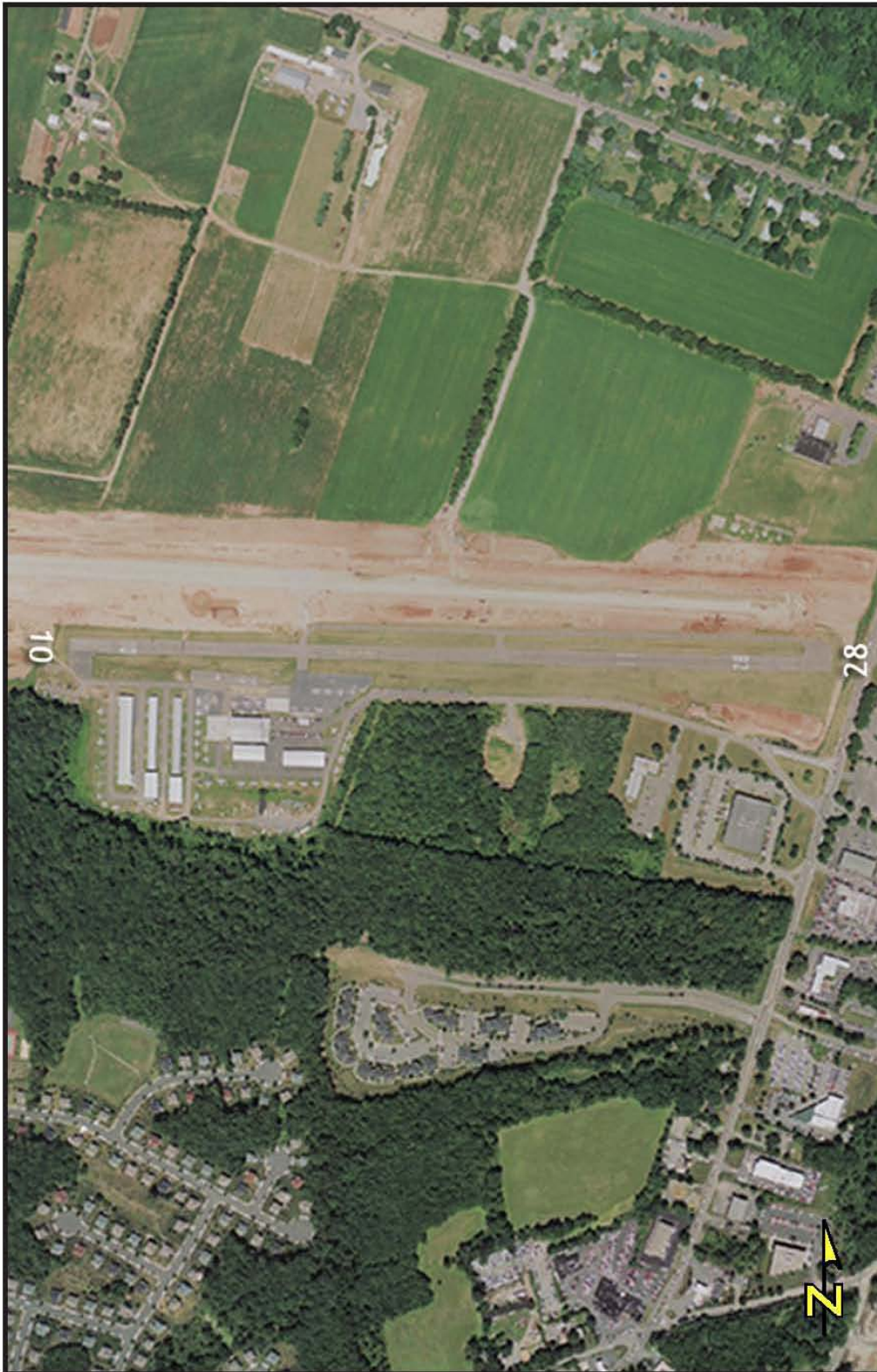
Princeton Airport (39N) Princeton/Rocky Hill, NJ