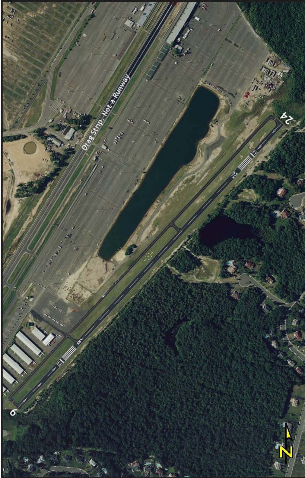
Old Bridge Airport (3N6) Old Bridge, NJ