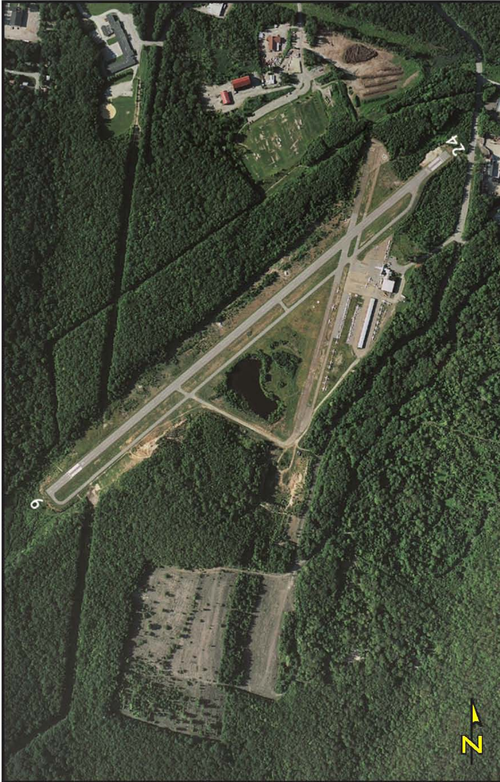
Greenwood Lake Airport (4N1) West Milford, NJ