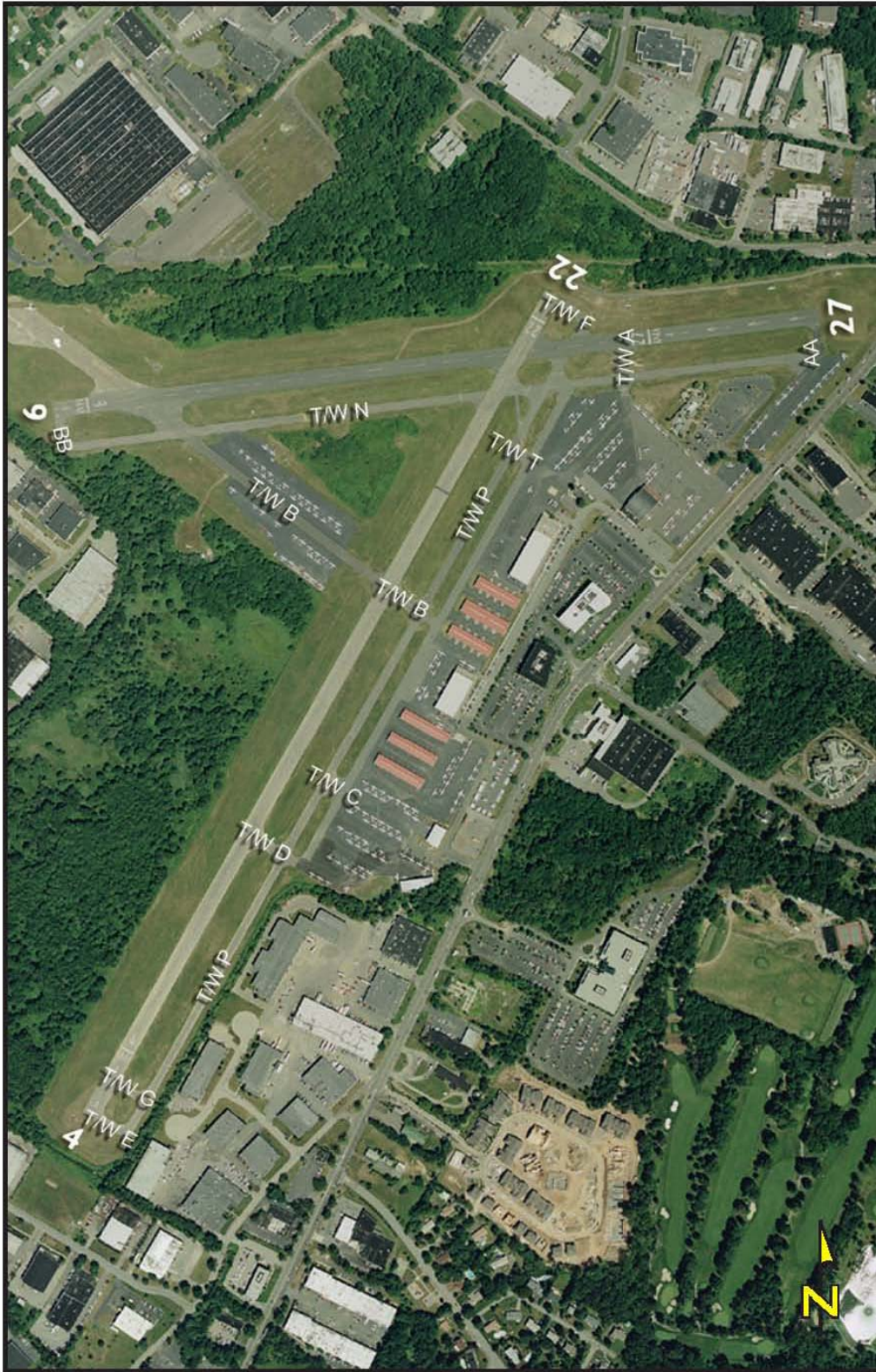
Essex County Airport (CDW) Caldwell, NJ