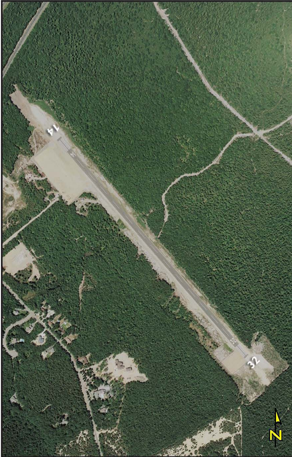
Eagles Nest Airport (31E) West Creek, NJ