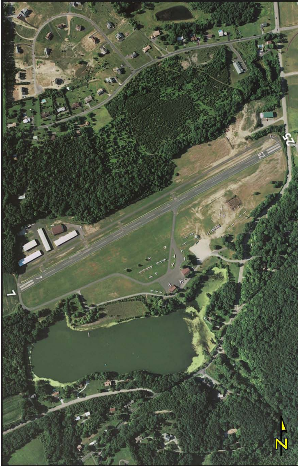
Blairstown Airport (1N7) Blairstown, NJ