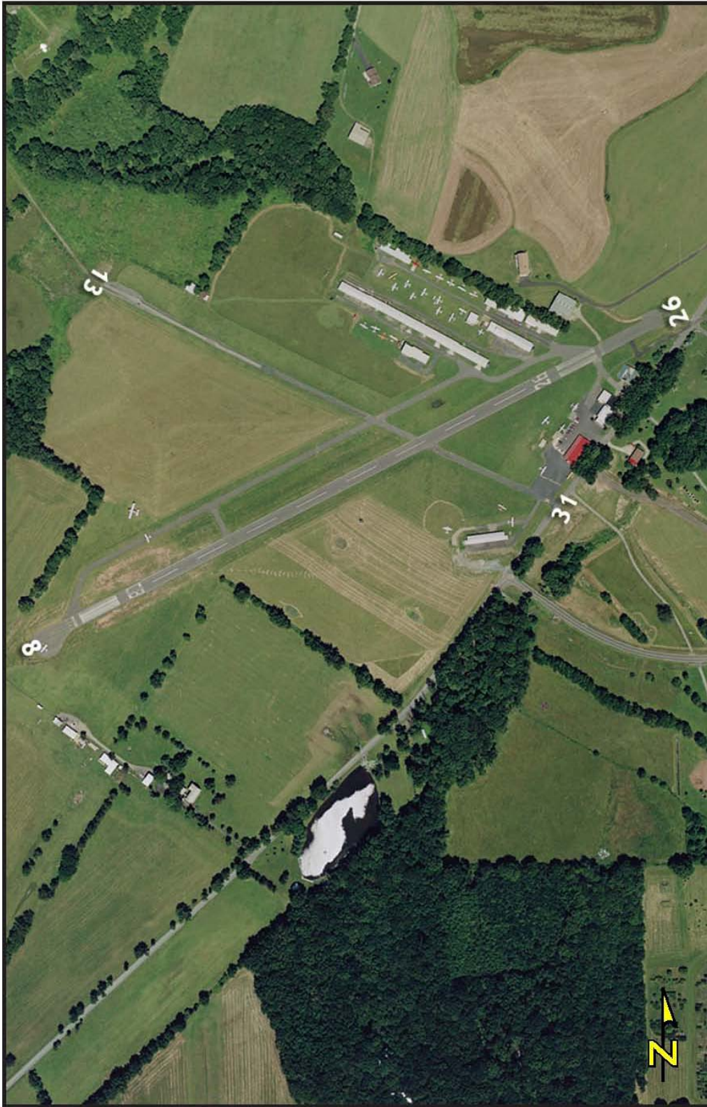
Alexandria Field (N85) Pittstown, NJ